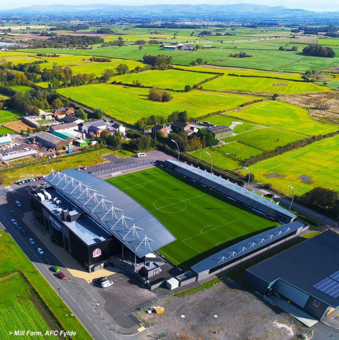
> Mill Farm, AFC Fylde

architecture • project management • structural engineering • interior design building surveying • m&e design • quantity surveying • cdm consultancy